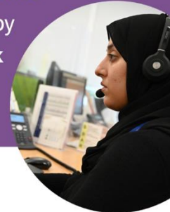
NHS 111 Call Handler

"NHS 111 is available if you need medical help or advice quickly. Reach us by visiting 111.nhs.uk or calling 111."