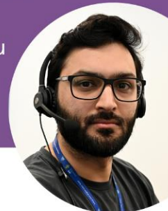
NHS 111 Call Handler

"Feeling unwell and unsure of where to turn? Think 111.nhs.uk first. We're here for you 24 hours a day, 7 days a week."